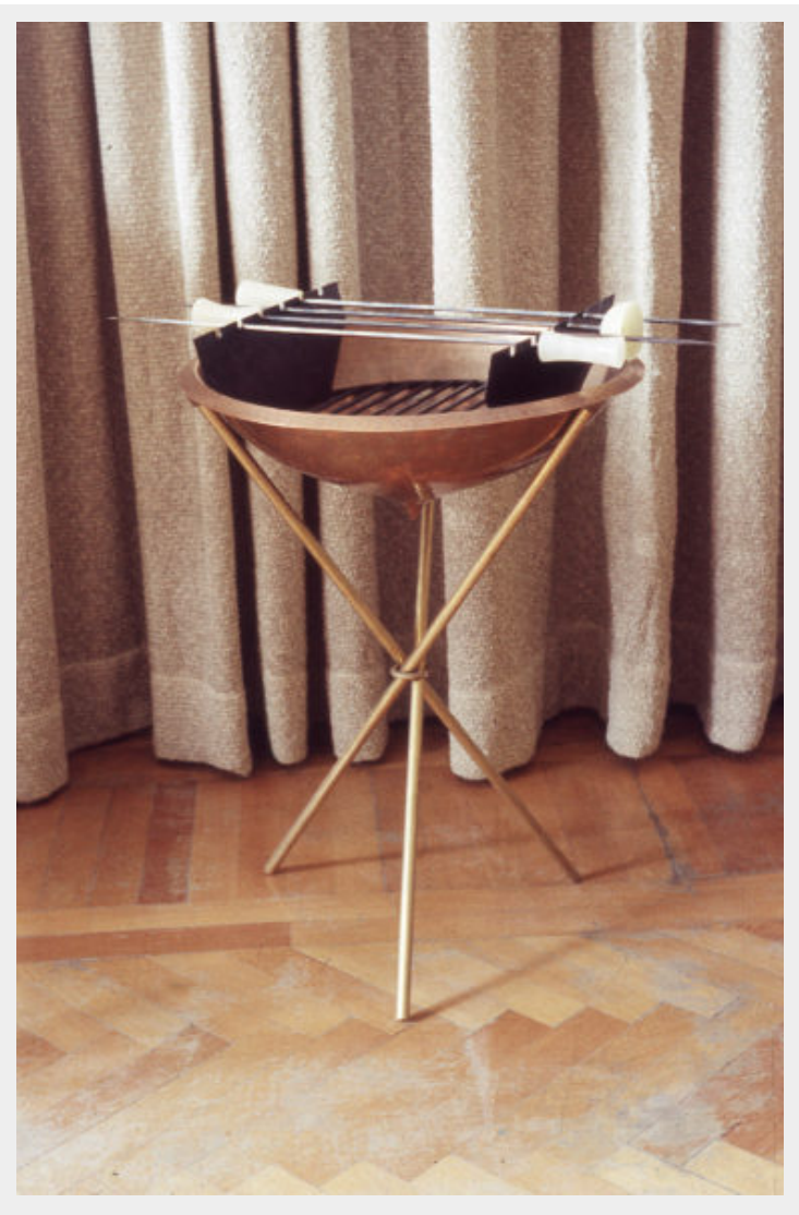
Fig. 7 – Barbecue, PMMA Archives.