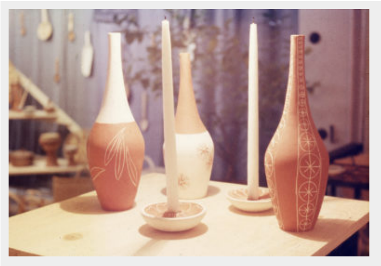
Fig. 5 – Vases and candleholders.