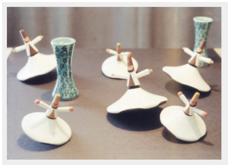
Fig. 6 – Whirling dervishes.