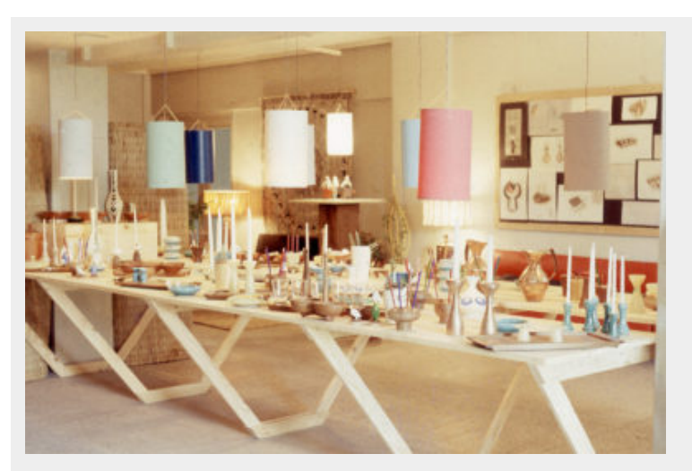
Fig. 3 - Turkish Handicraft Development Office showroom, PMMA Archives.