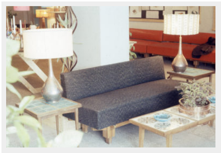
Fig. 8 - Furniture.