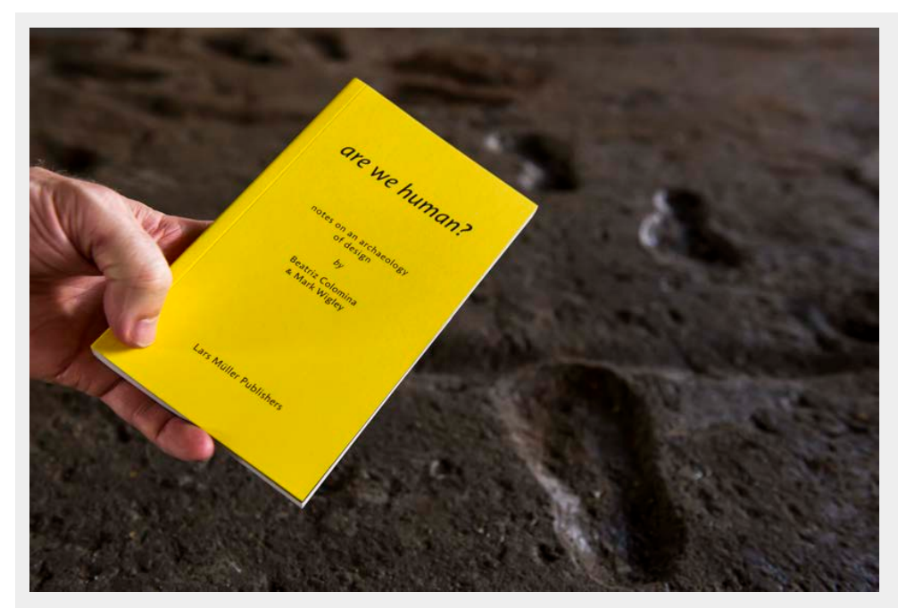
Fig. 1 – First copy of Are we human? next to cast of Neolithic footprints being produced at the Istanbul Archaeological Museums for the 3rd Istanbul Design Biennial, 2016 (◎ Poyraz Tütüncü; courtesy of IKSV).